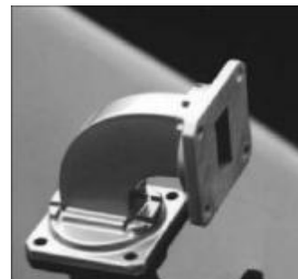
'H' Plane BEND