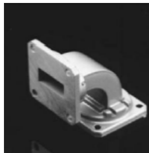
'E' Plane BEND