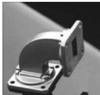
'H' Plane BEND